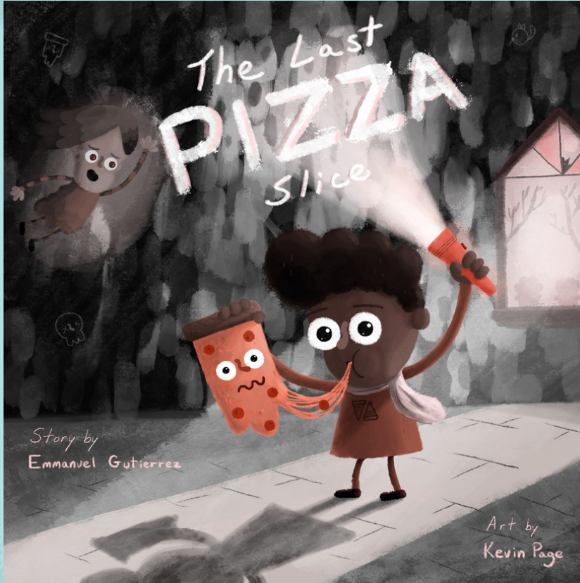
Art by Kevin Page