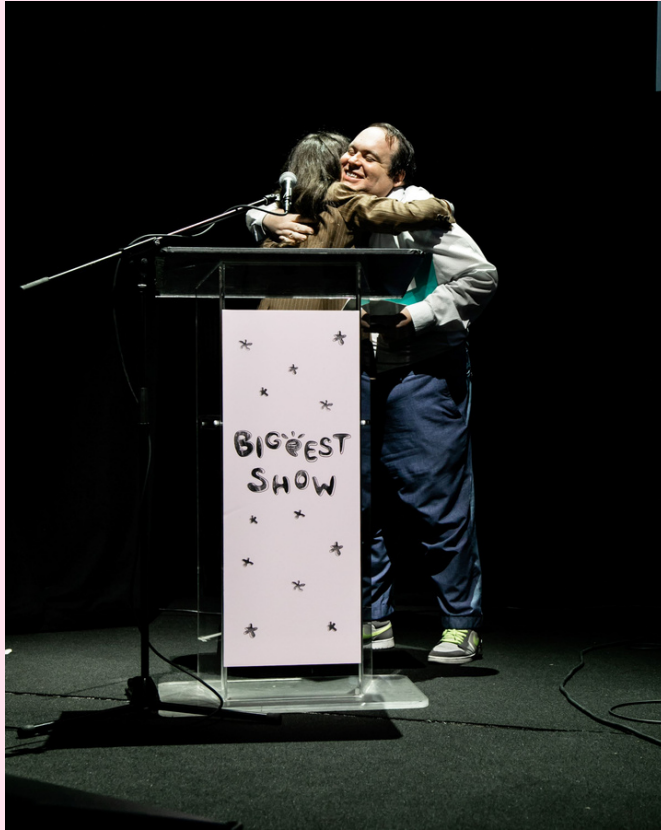
CELEBRATING OUR VOLUNTEERS WITH AN AWARD...