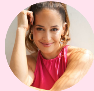
JAINA LEE ORTIZ